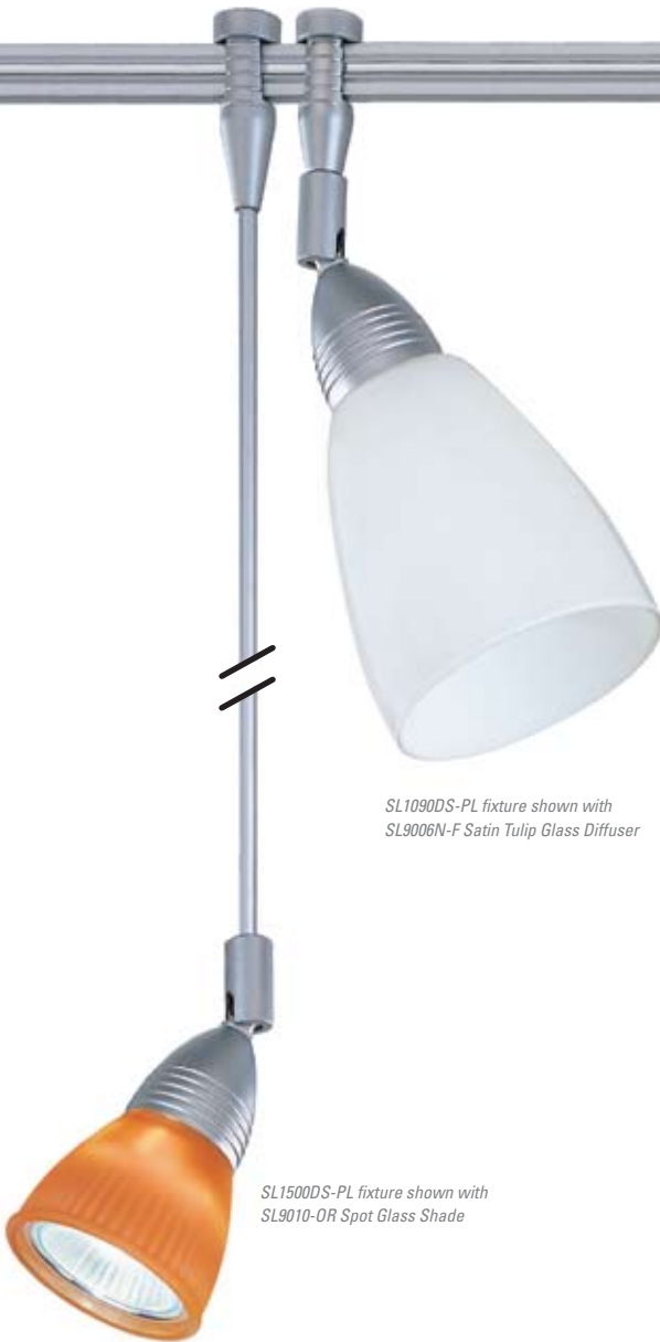
SL1090DS-PL fixture shown with SL9006N-F Satin Tulip Glass Diffuser