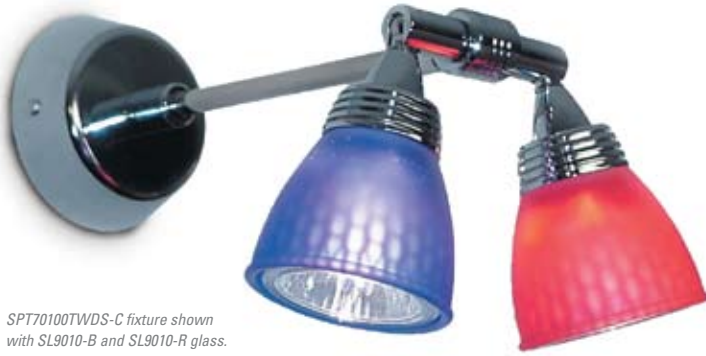
SPT70100TWDS-C fixture shown with SL9010-B and SL9010-R glass.