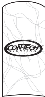
Custom Engraving Option